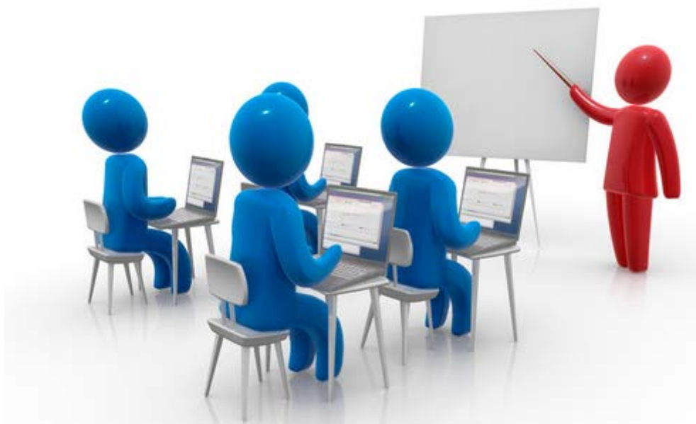
Figure 2 MOOC education model

The internationalization and popularization of higher education is a typical feature of MOOC, and people can receive higher education in any place with network connection conditions. Figure 2 shows the MOOC education model. Under the MOOC era, the number of college students is bound to increase significantly. Chinese college English teachers must use computer technology to achieve teaching and management tasks, especially using computer software to quickly generate test questions, edit teaching audio and video, publish and correct electronic versions of the work on the network, and track student progress. The analysis of learning effects, statistics and assessments, and the communication and communication skills of students on the Internet are particularly important. Learning to use artificial intelligence teaching system to reduce workload and improve teaching efficiency and teaching quality is one of the key skills that Chinese college English teachers should master as soon as possible [3] .